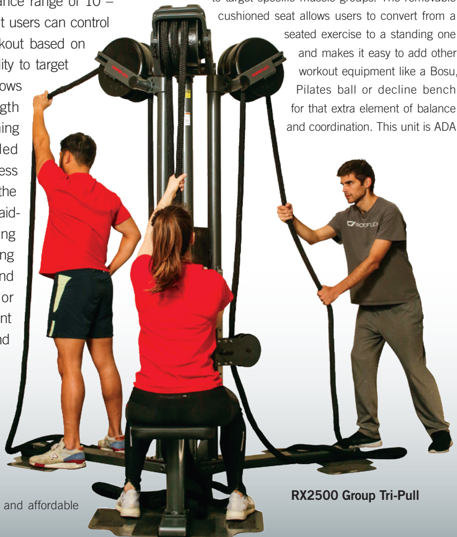
RX2500 Group Tri-Pull

The RX2500 is in a class of its own. This full size vertical rope pulling unit is a gym favorite. A fully adjustable middle pulley allows for virtually endless workout customization options. Pull vertical, horizontal, diagonal and backwards or alternate between one-arm and two-arm pulls for increased difficulty or to target specific muscle groups. The removable cushioned seat allows users to convert from a seated exercise to a standing one and makes it easy to add other workout equipment like a Bosu, Pilates ball or decline bench for that extra element of balance and coordination. This unit is ADA